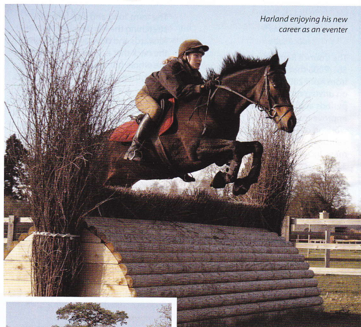
Harland enjoying his new career as an eventer

When the horses are brought in to begin their retraining, they are worked in long reins and on the lunge for at least the first week. This enables the riders to